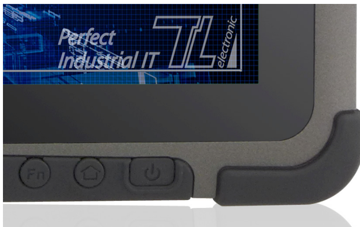
On/off push button

The unit can be switched on and off with the on/off push button.