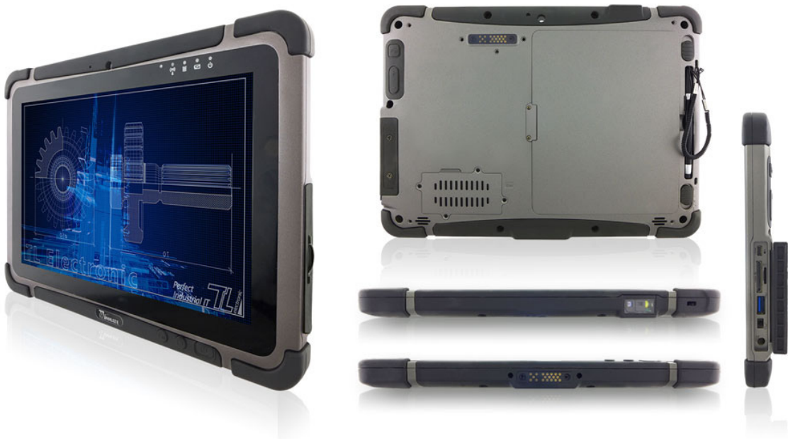
Interfaces and controls

All interfaces and are located on the right and bottom side.