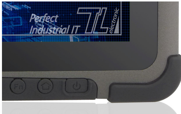
On/off push button

The unit can be switched on and off with the on/off push button.