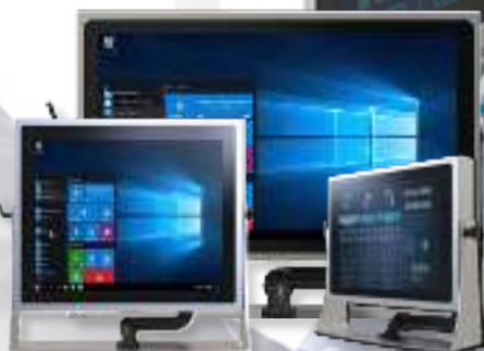
IP69K STAINLESS P SERIES WITH CONDUIT PIPE

WINMATE STAINLESS SERIES FOR THE FOOD, BEVERAGE AND CHEMICAL INDUSTRY