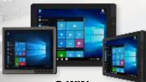
G-WIN IP67 SERIES PANEL PC