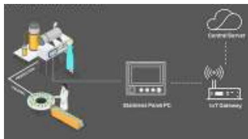
Application Diagram: Production Line HMI Terminal