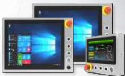
IP65 STAINLESS B SERIES WITH PUSH BUTTONS