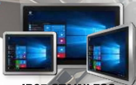
IP65 STAINLESS R SERIES PANEL PC