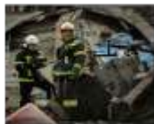
SEARCH & RESCUE