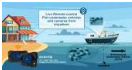
Application Diagram: Enhancing Underwater Drone Control

“ SEAMLESS PERFORMANCE BENEATH THE SURFACE. ”