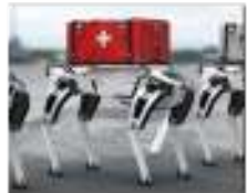
SURVEILLANCE & SECURITY