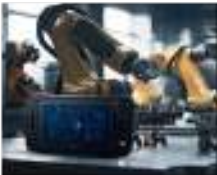
ROBOT CONTROL PANEL

With robust performance, durable construction, and high-precision capabilities, Winmate Robotics Controllers offer reliable and adaptable solutions for the most demanding environments and tasks.