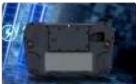
Extended Battery Life