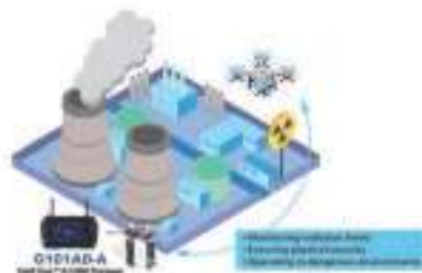
Application Diagram: Boosting Safety and Efficiency in Nuclear Plants

“ ENHANCING SAFETY THROUGH ADVANCED ROBOTICS CONTROL. ”