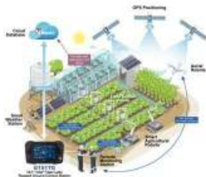
Application Diagram: Smart Agriculture with AI and Robotics